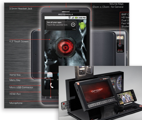
Motorola: Integrated Product Marketing Digital user experience in retail