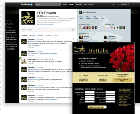
FTD: Say it Your Way Social engagement platform